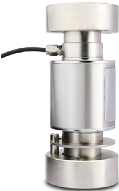
RCP: steel load cell, for high capacity weighing systems.